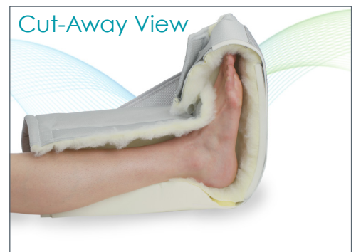
Cut-Away View Total Heel Offloading & Redistribution of Pressure Along the Calf