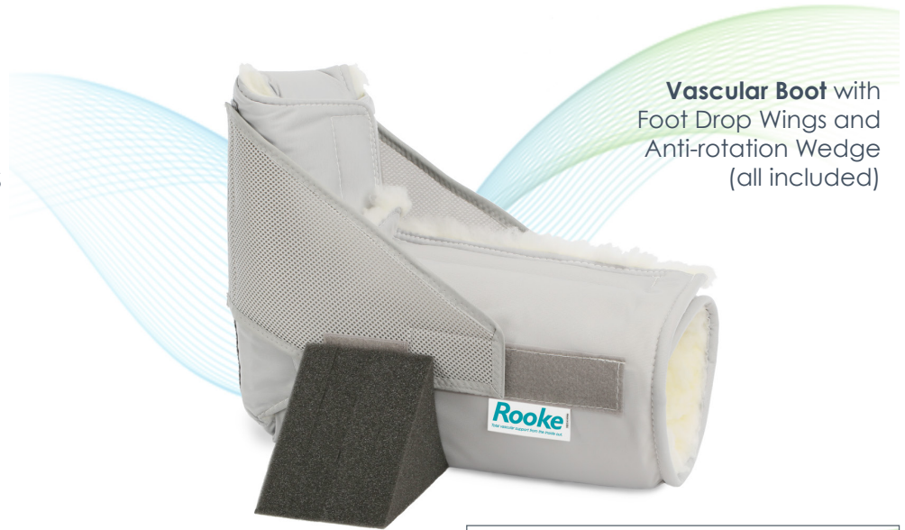
Vascular Boot with Foot Drop Wings and Anti-rotation Wedge (all included)